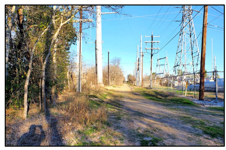
Ex. Utopia Ln. 55' ROW (Facing East)