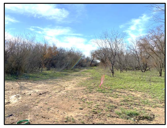
Ex. 50' Sanitary Sewer Easement (Facing South)