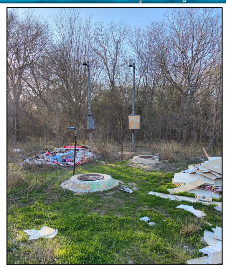
Downstream MH 1-1 Near Adjacent CIPP Project (Facing West)